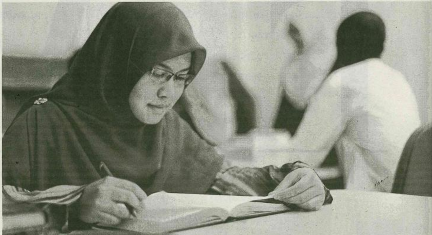
USIM's Faculty of Major Languages is established with the purpose of producing knowledgeable, proficient and professional graduates in the field of language studies.