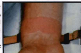
contact dermatitis; allergy to leather strap

So if you are asthmatic, avoid marrying another asthmatic or else your kids will be 50% more likely to have asthma as well. What else can we do? Nothing much, really. Avoidance is the best form of protection. If you know that you are allergic to something, then by all means avoid it. If you cannot resist the temptation, for example the prawn looks too delicious to give it a miss, then do have some anti-histamine [piriton/ clarityn/polaramine to name a few] available at hand. If anti-histamine cannot dampen down the allergic reaction, you may need some steroid.