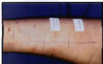
skin prick test in diagnosis of allergy

It has been estimated that the overall worldwide prevalence of allergic diseases is as high as 20% of population. Common allergic conditions seen worldwide are asthma, hay fever [allergic rhinoconjunctivitis] and eczema. Food allergy is also not uncommon and anaphylactic shock from peanut ingestion is one example of allergy that can be fatal.