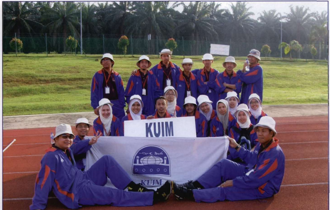
THE FPSK CONTINGENT POSING BEFORE THE MARCH PASS FOR THE 6 TH IPTA MEDICAL FACULTIES SPORTS TOURNAMENT AT UPM, 19 - 21 MAY 2006