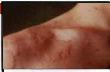
Wheal and flare of allergy

Only too frequent we encounter people, if not ourselves, itching here and there not long after enjoying seafood with the usual 'air asam belacan'. Worse still, in some more unfortunate souls, swelling could be a feature. In another scenario, a single bee sting will likely lead to a mere painful swelling at the site of the bite, and yet to another, it may cause such a widespread swelling to the extent of compromising his airway and result circulatory collapse [anaphylactic shock]. Why is there such a difference in responses? The explanation for such a varied response can be better understood by studying how our immune system behaves 'overzealously' towards the offending stimulus in a process known as ALLERGY.