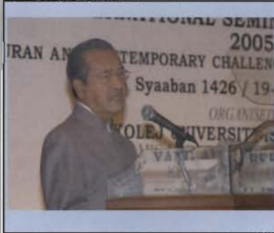
YAB Tun Dr. Mahathir Mohamed giving the keynote address at the Qur'an seminar.

The Islamic University College of Malaysia (KUIM), through the Faculty of Qur'an & Sunnah Studies, organized the International Seminar on Al-Qur'an from September 19-20, 2005 at the Pan Pacific Hotel in Kuala Lumpur. The seminar's theme was "Al-Qur'an and Contemporary Challenges in the Era of Globalization." The seminar sought to undertake the promotion and improvement of the awareness of Muslims throughout the world on the vital role of the Holy Qur'an as the source of knowledge and as the main foundation to the creation of a Muslim civilization. In addition, the seminar organizers saw that it was pertinent that Muslims are able to understand their Holy Book and relate it to their present knowledge in the science, technology and "k-economy" spheres.