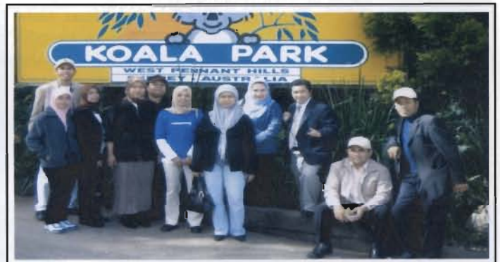
Antara staf KUIM yang mengikuti lawatan kerja ke Australia

Pelbagai program telah diatur sepanjang lawatan sambil belajar ke Australia ini. Antaranya lawatan ke beberapa universiti di Australia, Koala Sanctuary Park, Darling Harbour dan lawatan di sekitar laut Sydney dengan Kapal Kapten James Cook.