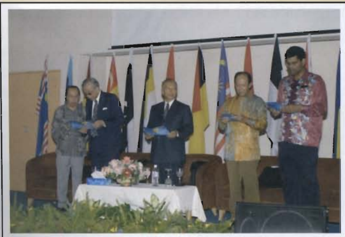
Nyanyian lagu Kemerdekaan pada majlis penutup Ceramah Kemerdekaan 2005.

Majlis ini dimulai dengan tayangan filem patriotik, "Merdeka for Malaya". Majlis ini diakhiri dengan sesi soal jawab dan penyampaian cenderamata. Bagi menyemarakkan semangat kemerdekaan bagi warga KUIM, nyanyian lagu Jalur Gemilang dan Keranamu Malaysia turut dimainkan dan dinyanyikan bersama-sama. Adalah diharapkan Ceramah Kemerdekaan kali ini memberi impak dan penghayatan jitu kepada seluruh warga KUIM.