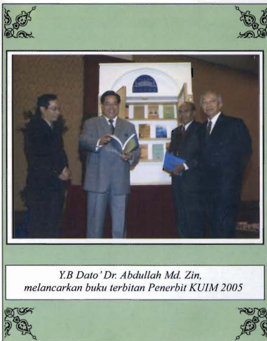
Y.B Dato' Dr. Abdullah Md. Zin, melancarkan buku terbitan Penerbit KUIM 2005

Majlis Pelancaran Buku KUIM 2005 yang diadakan pada 15 Disember 2005 ini telah dirasmikan oleh Menteri di Jabatan Perdana Menteri, Y.B Dato' Dr. Abdullah Md. Zin bertempat di Hotel Pan Pacific, KLIA Sepang. Pada tahun ini sahaja, sebanyak 13 buah buku dan 2 buah jurnal telah dilancarkan, termasuk buku Islam Hadhari yang bertajuk Rakyat Berjiwa Merdeka, Islam Hadhari : Penguasaan Ilmu Pengetahuan serta Islam Hadhari dan Kehidupan. Majlis ini juga telah dihadiri oleh tetamu dari IPTA lain dan badan berkanun yang bergiat di dalam penerbitan. Dalam ucapannya Y.B Dato' Dr. Abdullah Md. Zin melahirkan rasa bangga kerana KUIM terus maju ke depan dari setahun ke setahun untuk aktif dalam bidang penerbitan. Dalam majlis ini, penyampaian hadiah penghargaan turut diberikan kepada para penulis buku, penyunting, dan juga penulis akhbar yang aktif menulis sepanjang tahun 2005. Berikut merupakan antara penerima hadiah penghargaan penerbitan untuk tahun 2005: