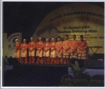
أحد الفرق المشتركة في المسابقة.