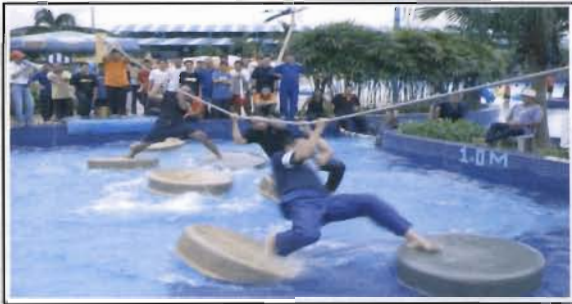
Having fun competing in the water at Family Day.

On the whole, it was a rather successful day and most of the staff and their children had a really good time. For two members of the staff, however, the day was marred by their discovery that their cars had been broken into in the parking area of the water park and items had been stolen from inside the cars.